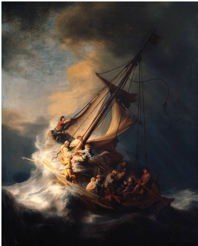
Christ in the Storm on the Sea of Galilee , by Rembrandt van Rijn, oil on canvas, 1633, Isabella Stewart Gardner Museum.

We enter this church not as strangers, but as children of God.