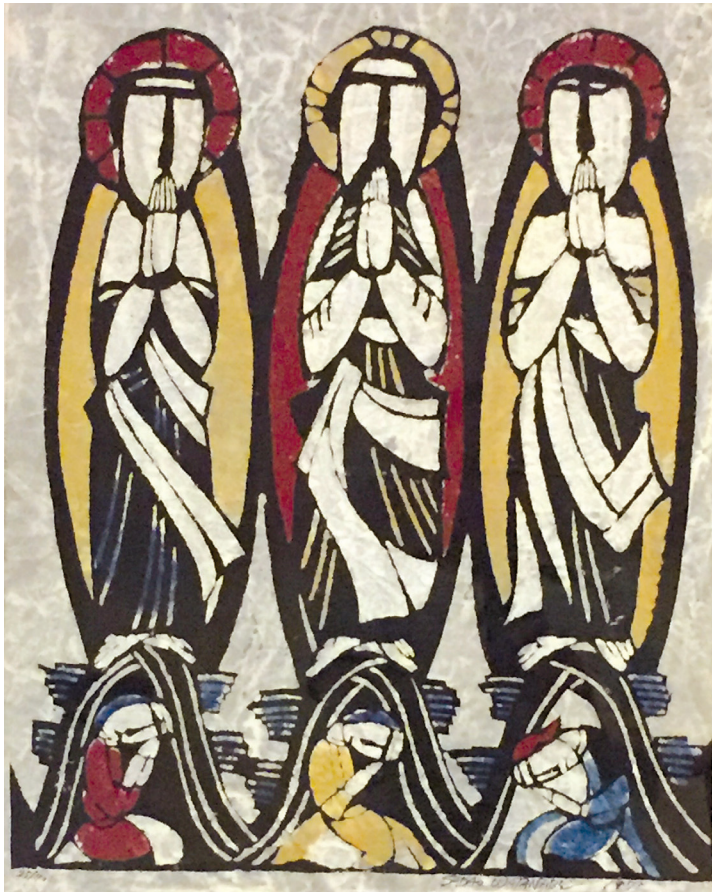
The Transfiguration , by Sadao Watanabe, stencil print, Japan, 1971

We enter this church not as strangers, but as children of God.