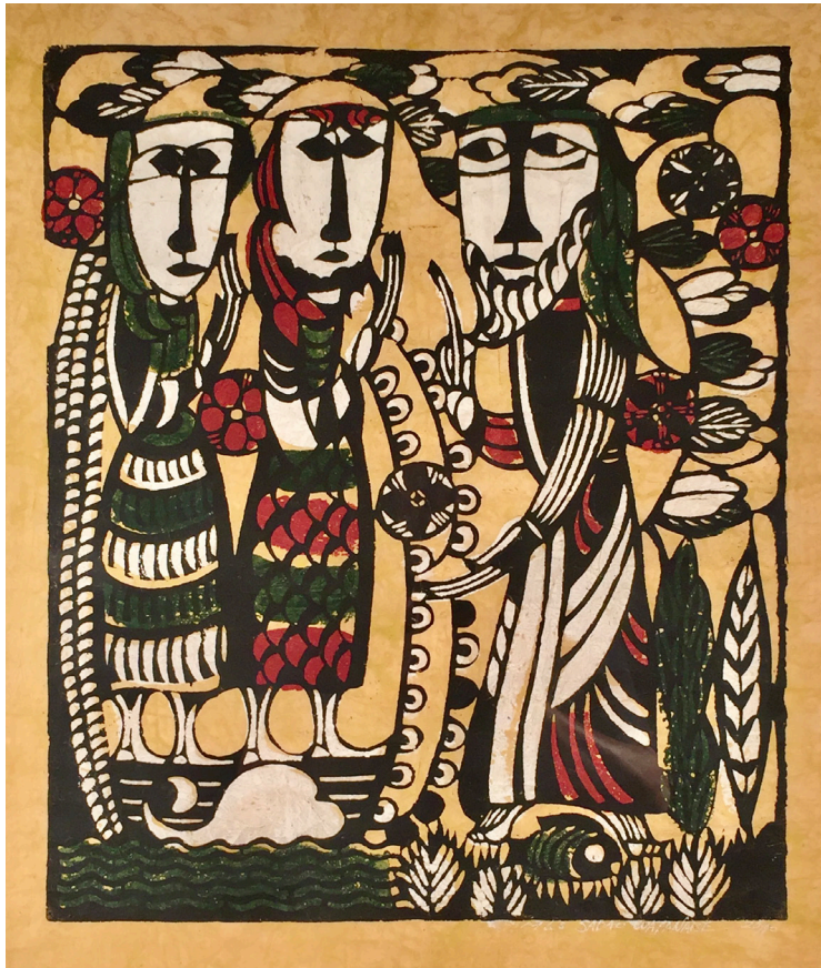
Jesus Calling the Two Fishermen , by Sadao Watanabe, stencil print, 1963, Japan The Westminster Collection

We enter this church not as strangers, but as children of God.