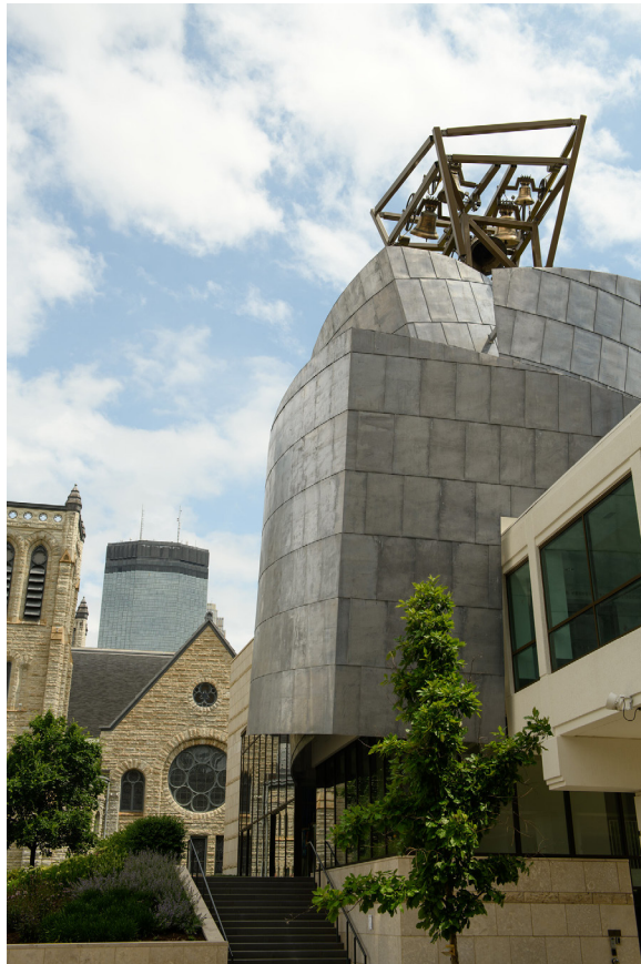
Westminster and Bells , by Tom Northenscold

We enter this church not as strangers, but as children of God.