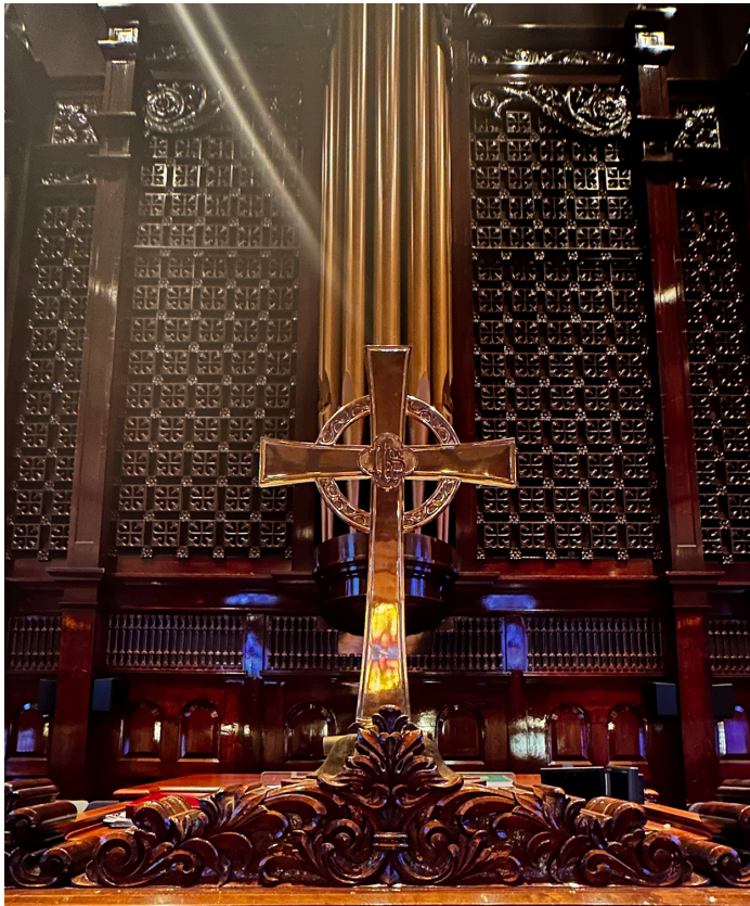
Celtic Cross, Westminster Sanctuary

We enter this church not as strangers, but as children of God.