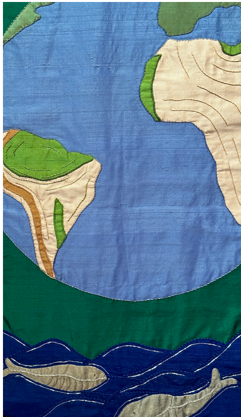
Westminster's Green Paraments (detail), by Phyllis Lehmborg, silk applique and embroidery

We enter this church not as strangers, but as children of God.