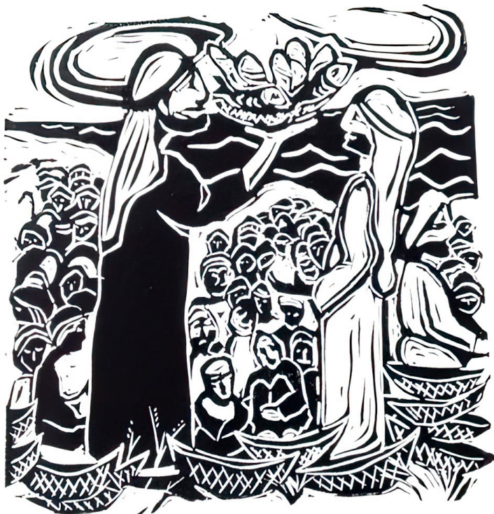
Feeding the Multitudes , by Cara B. Hochhalter, linocut print The Westminster Collection

We enter this church not as strangers, but as children of God.