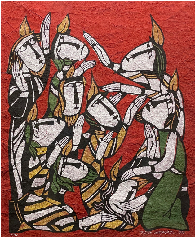
Pentecost , by Sadao Watanabe, katazome stencil print, 1975, Japan The Westminster Collection

We enter this church not as strangers, but as children of God.