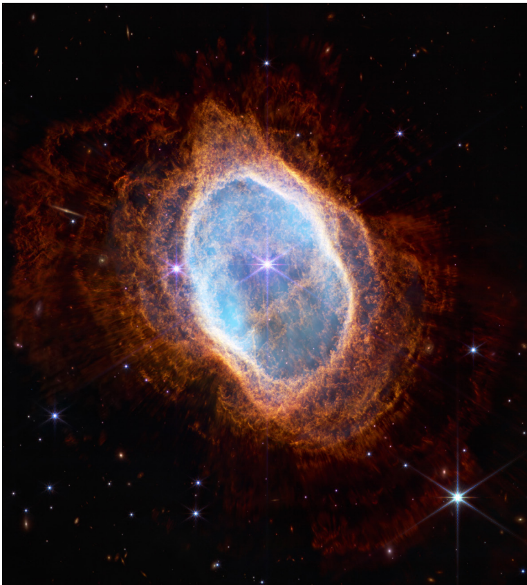
Southern Ring Nebula, NGC 3132, James Webb Space Telescope, 2022; NASA and the Space Telescope Science Institute

We enter this church not as strangers, but as children of God.