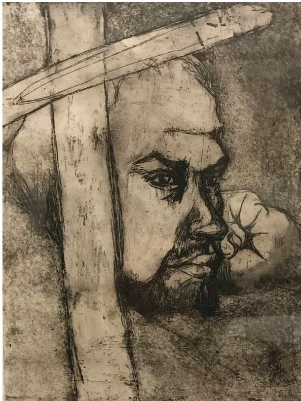
Contemplation , by Joan Eastman, aquatint, n.d. The Westminster Collection, on view in the Westminster Gallery

Westminster is the church in the world, online and in person. We belong to one another and to God. Thanks be to God!