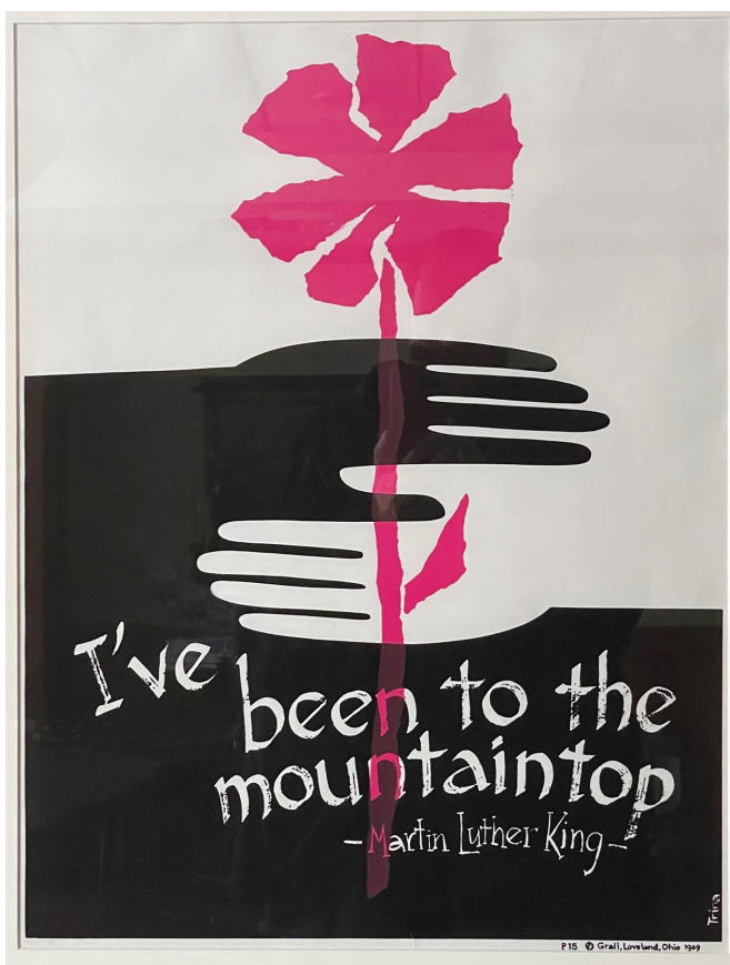
I've been to the mountaintop , by Trina, silkscreen, 1969 The Westminster Collection

Martin Luther King Jr. Sunday, January 16, 2022