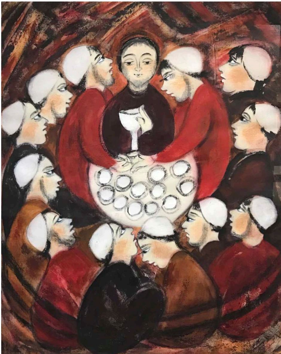
The Last Supper, by Nalini Jayasuriya, oil on cotton, Sri Lanka, the Westminster Collection